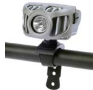
2010 PRODUCT COMPARISON CHART